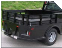
ROUGHNECK CONTRACTOR PACKAGE