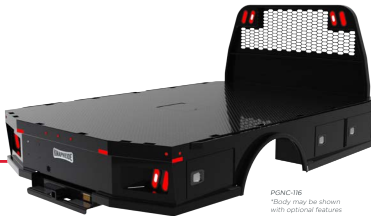
PGNC-116 *Body may be shown with optional features