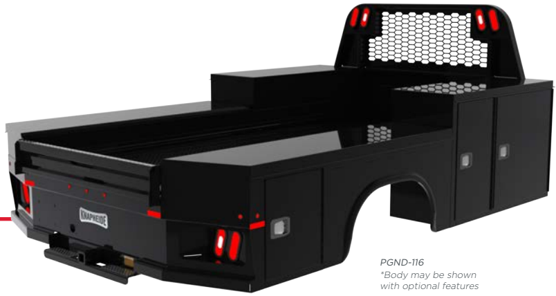
PGND-116 *Body may be shown with optional features