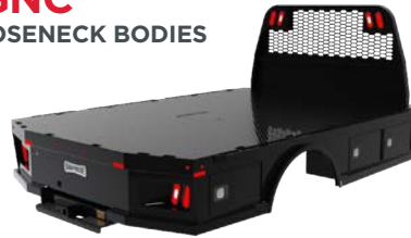
// PGNC GOOSENECK BODIES