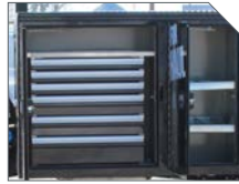
C-TECH DRAWER SETS