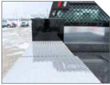
ADDITIONAL ALUMINUM TREAD PLATE OVERLAY