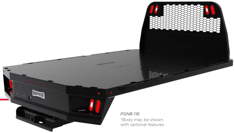
PGNB-116 *Body may be shown with optional features