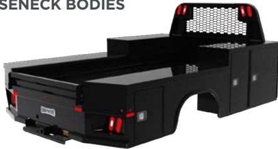
// PGND GOOSENECK BODIES