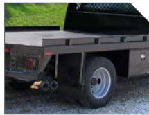
4" REMOVABLE SIDE BOARDS