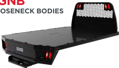
// PGNB GOOSENECK BODIES