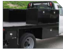
ABOVE BODY AND UNDERBODY TOOLBOXES