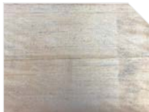
APITONG WOOD FLOOR