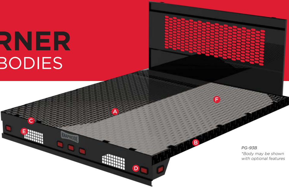
PG-93B *Body may be shown with optional features

The Westerner Platform Body is one of Knapheide’s most economical, yet reliable, flatbed models. The distinct wrap-around floor design and one piece rear skirt make the Westerner Platform stand out from the crowd.