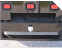
UNDERBODY STORAGE COMPARTMENT