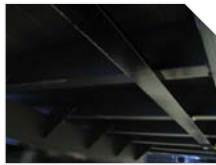
UNDERBODY TIE-DOWN RAILS