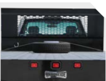
SPARE TIRE RETAINER