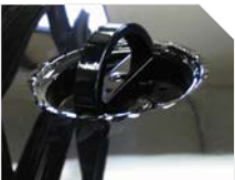
INTEGRATED D-RING TIE DOWNS