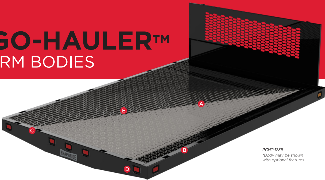
PCHT-123B *Body may be shown with optional features

Knapheide's Cargo-Hauler™ (PCH) platform has a robust understructure to withstand tough job site applications. The PCH is a heavy duty platform with distinctive tail skirt styling. It has been engineered to work in both hoist and non-hoist applications.