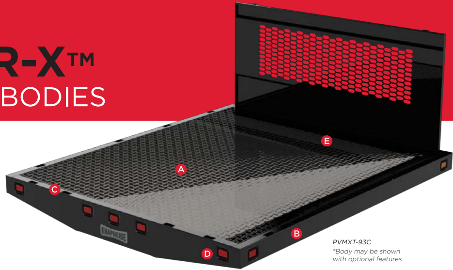
PVMXT-93C *Body may be shown with optional features

Knapheide’s most popular platform, the Value-Master-X™ (PVMX), is a value-priced standard duty platform with distinctive tail skirt styling. It has been engineered to work in both hoist and non-hoist applications.