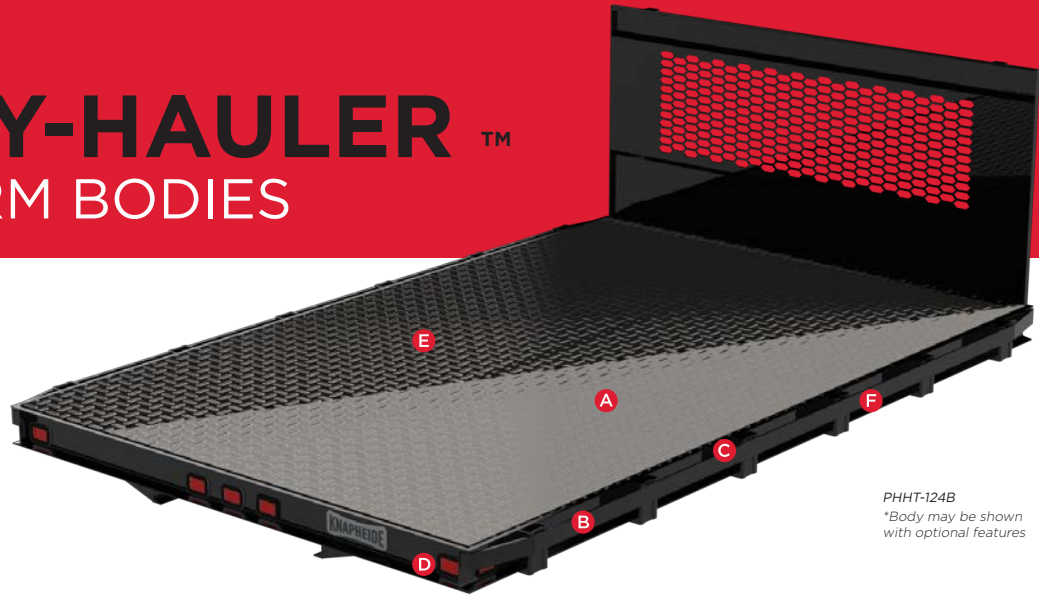
PHHT-124B *Body may be shown with optional features

The Heavy-Hauler™ (PHH) is Knapheide's most rugged platform, designed to handle the most severe of hauling applications. It has been engineered to work in both hoist and non-hoist applications.