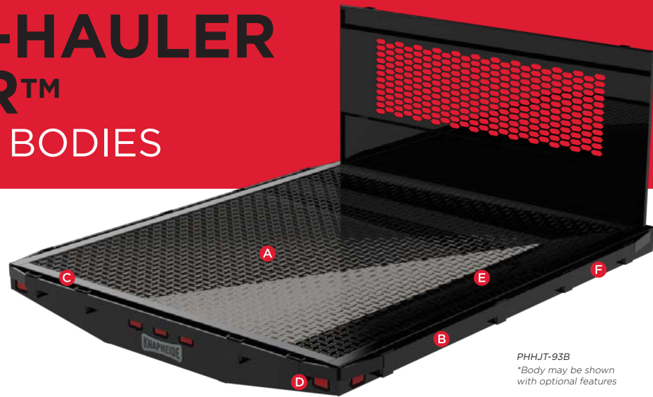
PHHJT-93B *Body may be shown with optional features

The Heavy-Hauler Junior™ (PHHJ) is a durable, standard duty platform with distinctive tail skirt styling and rub rails. It has been engineered to work in both hoist and non -hoist applications.