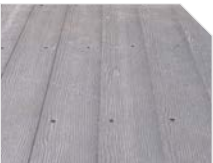
POLY BOARD FLOOR